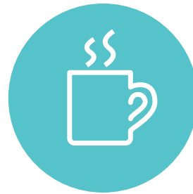
Tea & Coffee