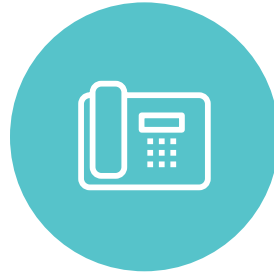
Telephone System with VOIP