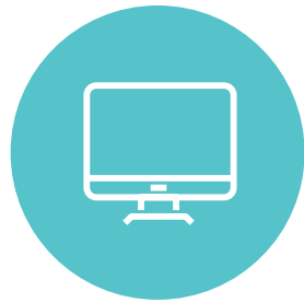
Fibre Internet & CAT 6